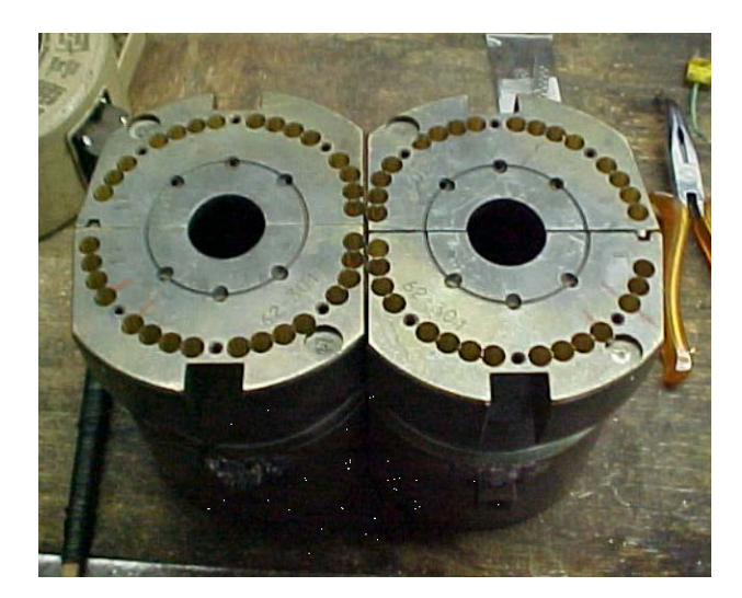
Figure 3 – Diffuser exits implemented on a mold

In practice the limitation for opening up the bores is the neighboring bores. Therefore the most practical way is to choose a reamer and tapering the bores until they just slightly run into each like shown in Figure 3.