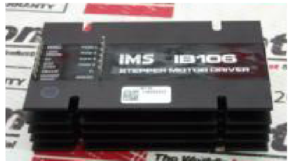
Veritas iB Stepper Motor Control Panel

Due to part obsolescence, the IB106 Stepper Driver (12706P) for the Veritas iB belt handler will no longer be available and will be replaced with update kit # 27533A when needed.